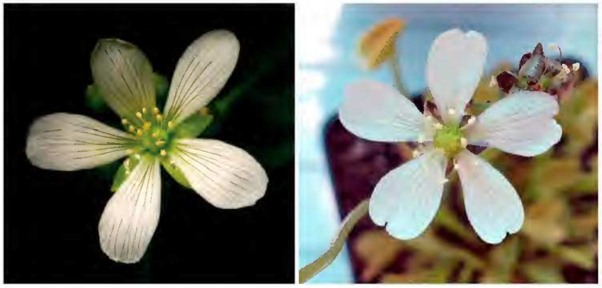
Figure 9: Dionaea flowers: typical (left) and 'Cheerleader' (right).